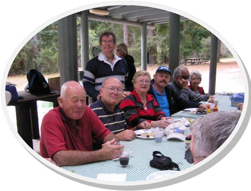
Lunch at Central Station