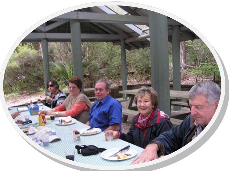
The rest of the hungry travellers