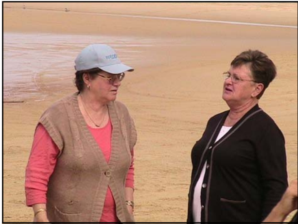
This could be a serious situation.