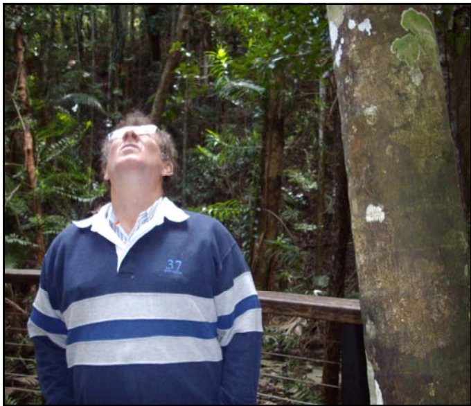
Yes, it is a tall tree, Juri.