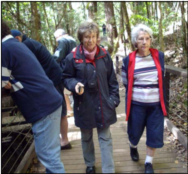
Stick 'em up!!