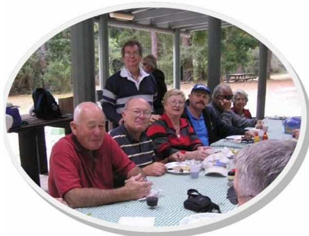
Members of Redlands enjoying a weekend away

In August Redlands made their annual trip out of town to Rainbow Beach and Frazer Island. It appears everyone had a great time.