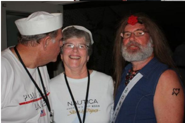
Past and Present Wizzy winners