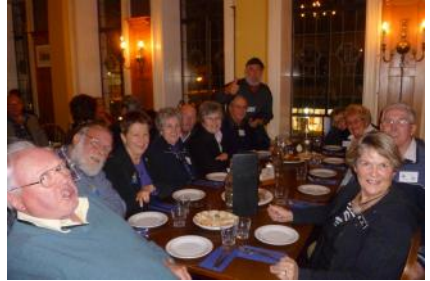
Pasta night with Gore 41 members

Even without the sun, travelling through the rain & mist to Milford Sound was interesting. There were very high rugged mountains, weather worn rocks at the Chasm & reflections of the mountains at Mirror Lake. The Milford Sound Cruise was still worth going on as the waterfalls were fantastic & you could still see the wonderful high mountains ending at the waterline. Another noisy meal at the ‘Moose’ ended a lovely day even though it was then that we found out the volcanic ash was affecting plane travel from New Zealand.